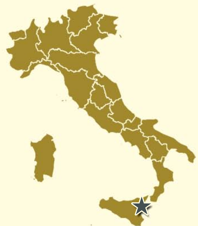
Grand Hotel San Pietro Taormina, Messina - Sicily

The Grand Hotel San Pietro is also an ideal base from which a range of unique excursions can be organized - a trip to the Volcano of Etna, to the medieval town of Castelmola or to the nearby Aeolian Islands, with its natural springs and breathtaking landscapes, are sure to delight those seeking a special holiday experience.