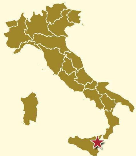
Tenuta ChiuSe del Signore Linguaglossa, Etna - Sicily

The serendipity of 60 hectares of lazy vineyard-hopping drives, covering the fertile volcano lower slopes, is heightened by the region's postcard-perfect sicilian landscape.